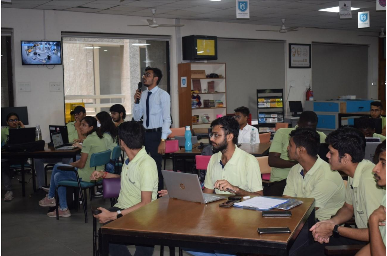
Interaction with expert: